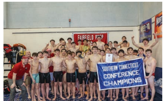
Fairfield Prep won the 2026 SCC boys swimming title totaling a league record 1628.5 points