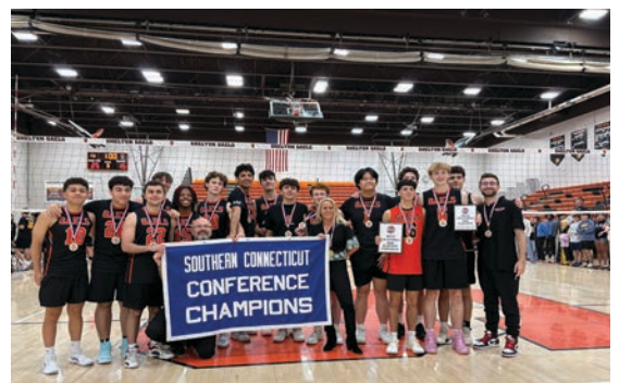
Shelton captured its second straight SCC boys volleyball playoff title in 2026 and proceeded to win its first state title since 2005