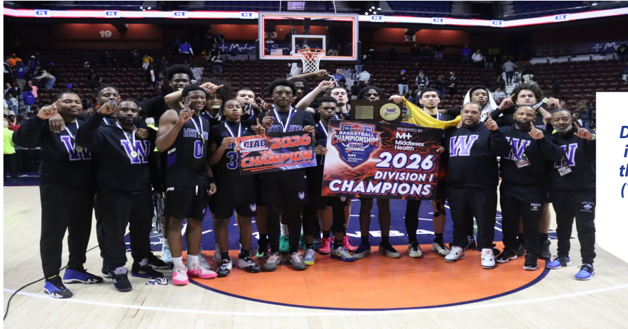
West Haven captured the Division I boys basketball title in 2026. The Blue Devils won their first state title since 1987.