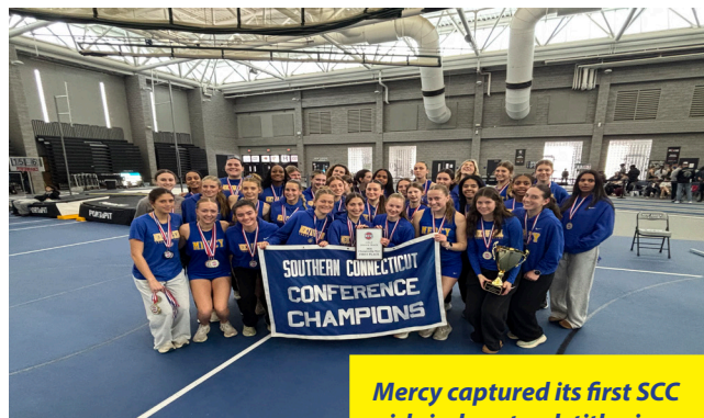
Mercy captured its first SCC girls indoor track title since 2016.