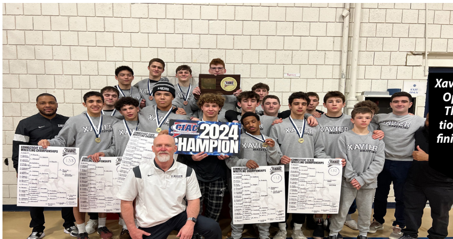
Xavier won the Class L and State Open wrestling titles in 2024. The Falcons, under the direction of Mike Cunningham, also finished second in New England.