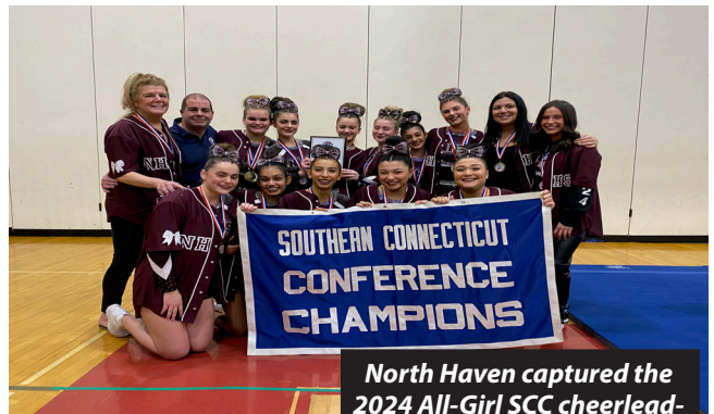
North Haven captured the 2024 All-Girl SCC cheerleading title (Steady Photography photo).

Girls: 1. Cheshire, 63; 1. Shelton, 63; 3. Hillhouse, 48; 4. Mercy, 42; 5. Career Magnet, 41; 6. Sheehan, 31.5; 7. Daniel Hand, 29; 8. Sacred Heart Academy, 25; 9. Branford, 24; 10. Amity Regional, 23.5; 11. Guilford, 17; 12. Hamden, 16; 12. West Haven, 16; 14. Wilbur Cross, 14; 15. Jonathan Law, 6; 16. Foran, 3; 17. Luralton Hall, 2; 18. North Haven, 1