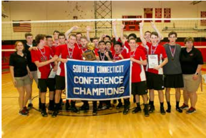
Cheshire won its sixth SCC boys volleyball title; all since 2009.