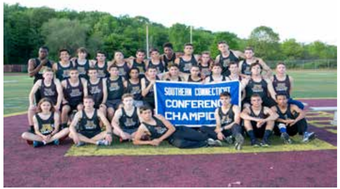
Amity Regional won its 10th SCC outdoor track & field title since 1995.