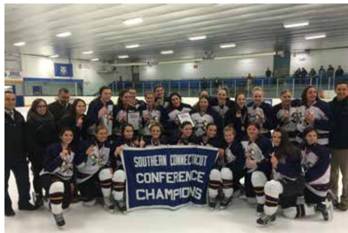
East Catholic/Glastonbury/South Windsor – Div. I girls ice hockey champions

Semifinals – Feb. 22 @Higher Seeds #1 Amity/North Haven/Cheshire 6, #4 Notre Dame-Fairfield 2 (Feb. 24) #2 West Haven/SHA 2, #3 Daniel Hand 0 Championship Game – Feb. 26 @Bennett Rink Amity/North Haven/Cheshire 2, West Haven/SHA 1