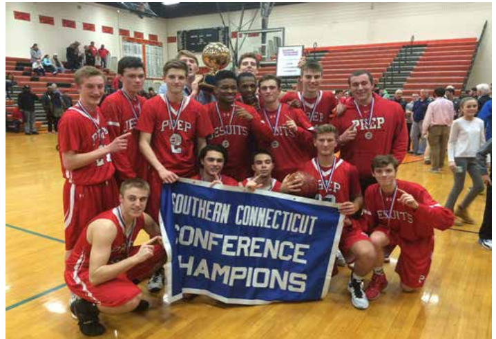
Fairfield Prep held off Hillhouse to capture the 2016 SCC basketball title.

#7 Hamden 72, #10 Lyman Hall 67 #8 Daniel Hand 70, #9 Cheshire 64