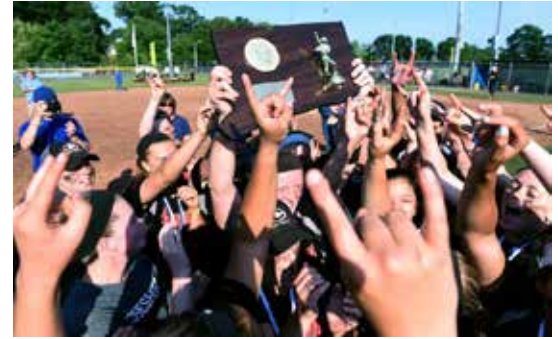
Cheshire softball celebrates its state title

The Cheshire softball team finishes a 27-0 perfect season by capturing the Class LL state title with a 5-0 win over SCC-rival Amity Regional on June 11. Two weeks earlier, the Rams won the SCC title, defeating Luralton Hall, 4-3.