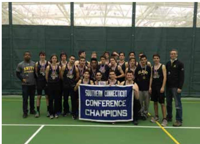
Amity Regional captured its eighth SCC indoor track title since 2004.

EAST SECTIONAL MEET – Jan. 28 @Floyd Little Athletic Center Final Team Results: 1. Amity Regional, 129.33; 2. Hillhouse, 82; 3.