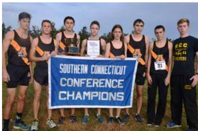
Amity Regional won its sixth SCC boys cross country title in 2015