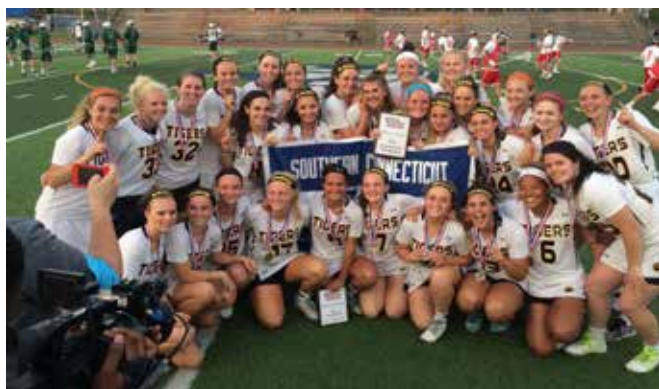
Daniel Hand won its ninth outright SCC girls lacrosse title in 2016.