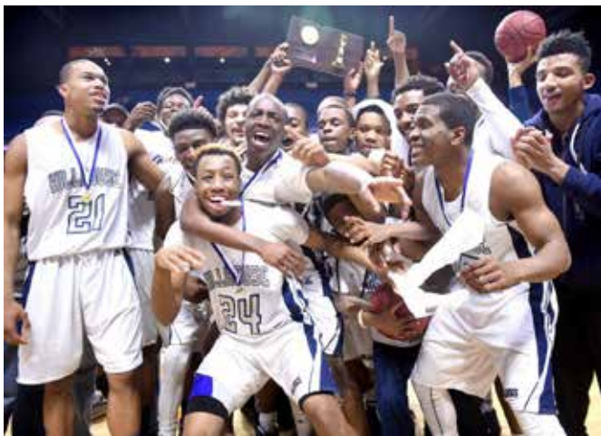
Hillhouse boys basketball outlasted Weaver in double overtime, 96-83, in the Class LL state championship game on March 20 at Mohegan Sun Arena.

North Haven football (Class L) – lost to New Canaan, 42-35