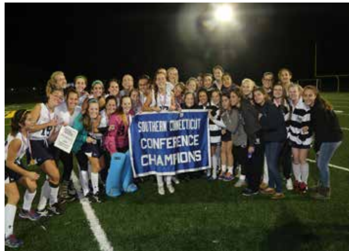
Luralton Hall won its first-ever SCC field hockey title in 2015.