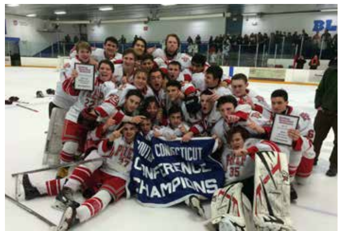
Fairfield Prep – Div. I boys ice hockey champions