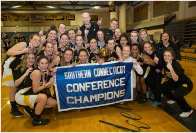
Daniel Hand won its first-ever SCC girls basketball title.