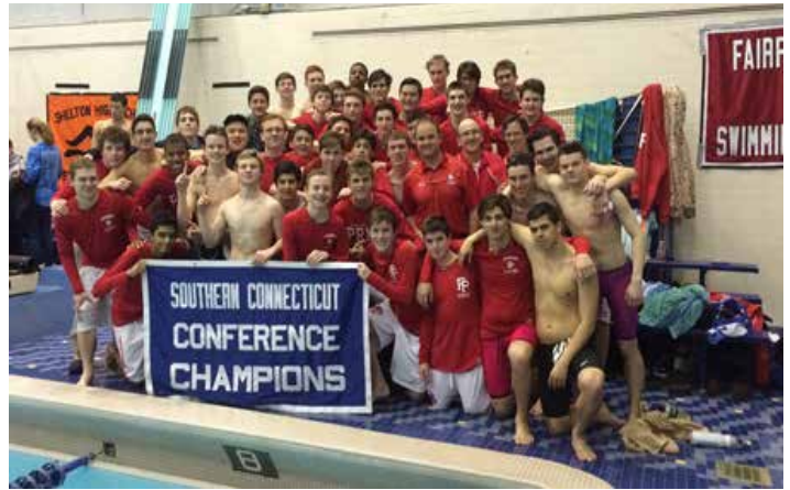
Fairfield Prep won its 12th straight SCC boys swimming title.

200 yard IM: Corey Gambardella (Branford/Guilford), Oliver Rus (Fairfield Prep), Ryan Mostoller (Cheshire)