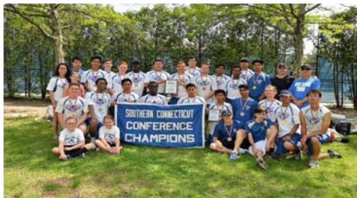
West Haven – Div. II boys tennis champions