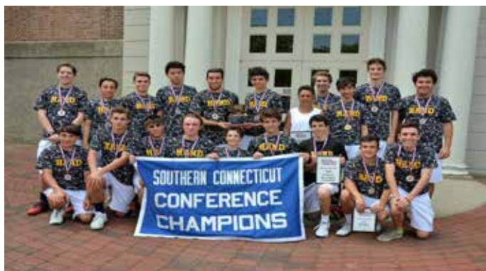
Daniel Hand – Div. I boys tennis champions