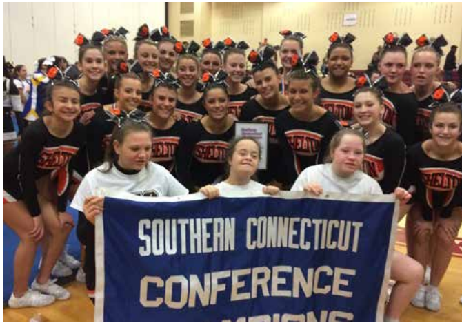
Shelton won its 11th straight SCC cheerleading title in 2016.