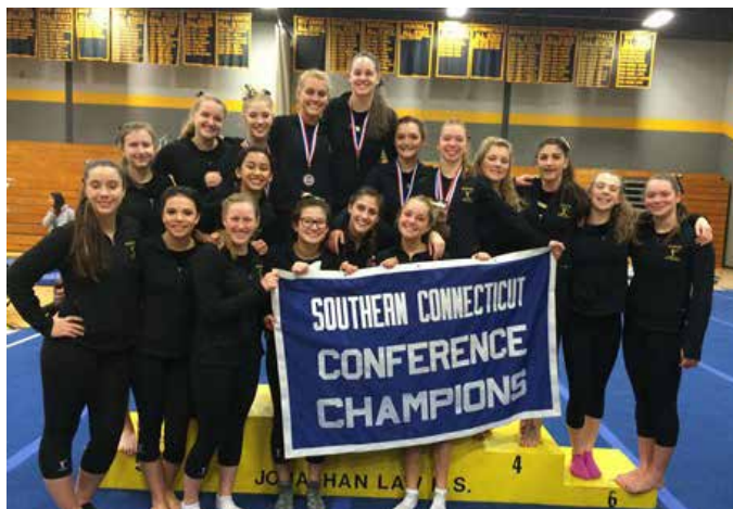
Daniel Hand won its eighth straight SCC gymnastics title in 2016.