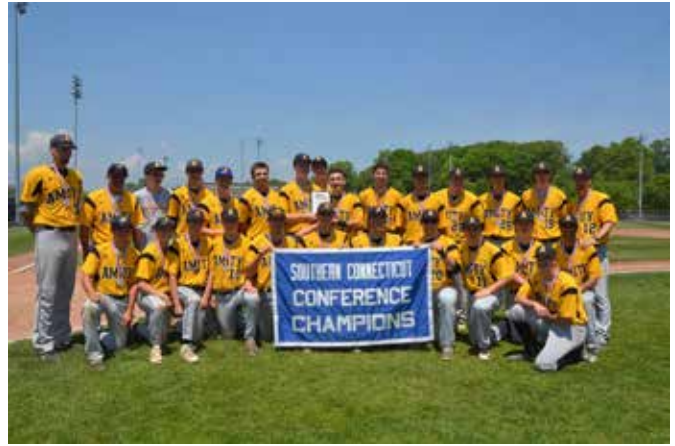
Amity Regional won its sixth SCC baseball playoff title in 2016.