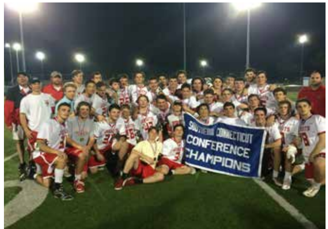
Fairfield Prep won its 12th SCC boys lacrosse league title in 2016, and its fifth in the last six years.