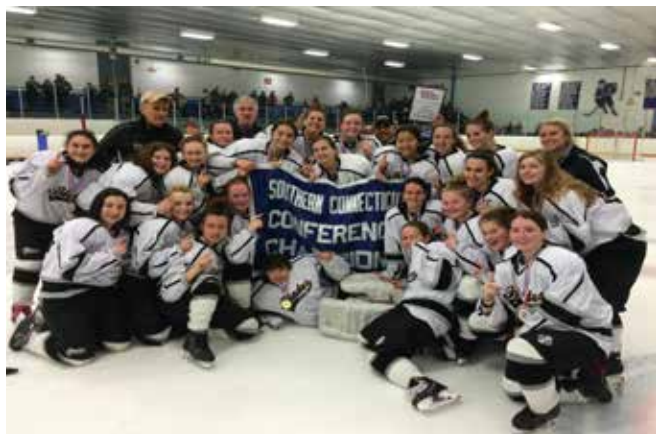
Amity/Cheshire/North Haven - Div. 2 girls ice hockey champions