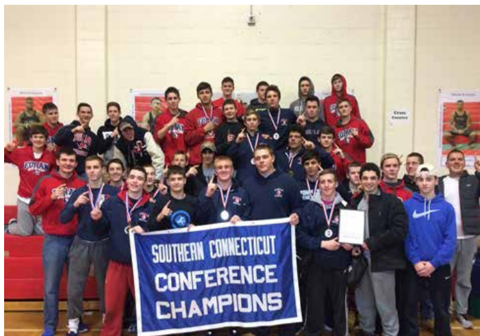
Foran won its first-ever SCC wrestling title in 2016.