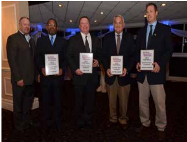
2015 SCC Football Divisional champion coaches