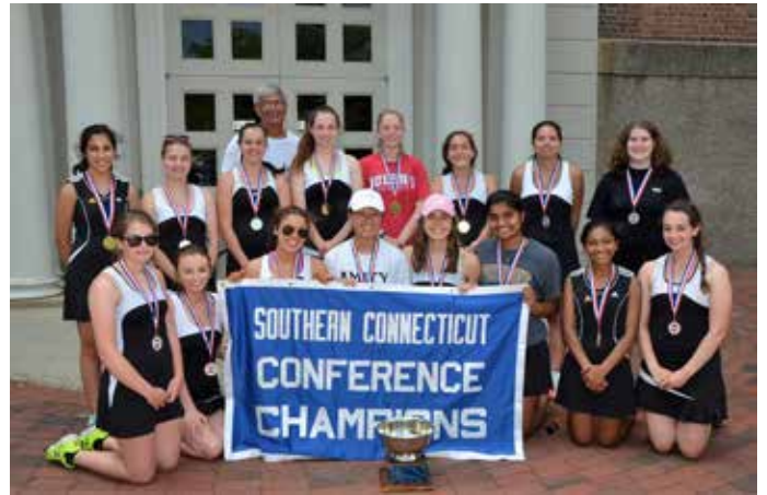
Amity Regional – Div. I girls tennis champions