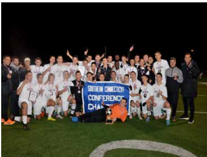
Shelton won its first-ever SCC boys' soccer title in 2015.