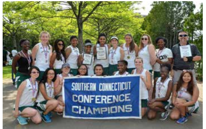
Hamden– Div. II girls tennis champions