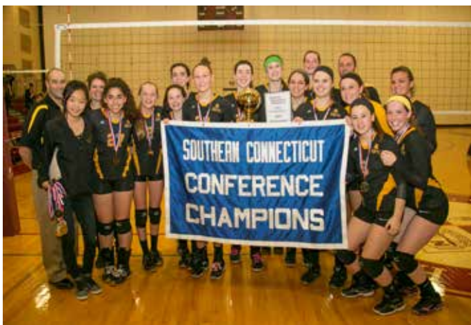
Amity Regional won its first outright SCC girls volleyball title since 2007.