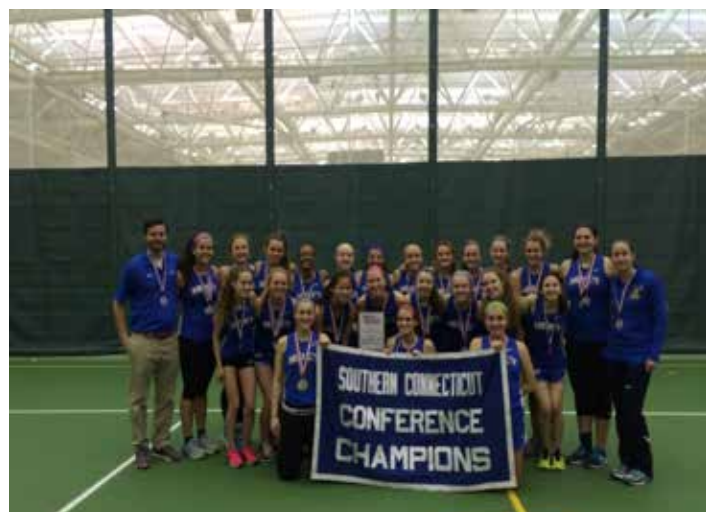
Mercy captured the SCC indoor track title for the second straight year.