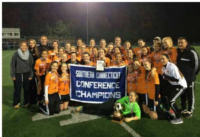
Shelton won its second SCC girls soccer title in 2015.