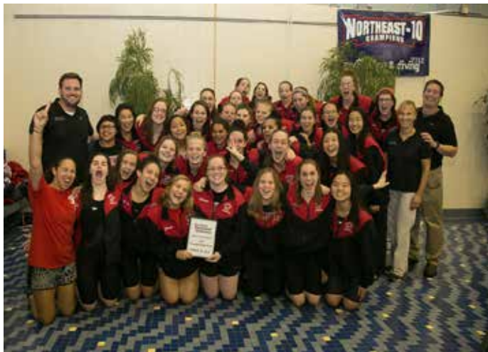
Cheshire has won 21 of the 22 SCC girls swimming titles.

DIVISION I REGULAR-SEASON CHAMPION: Cheshire (7-0)