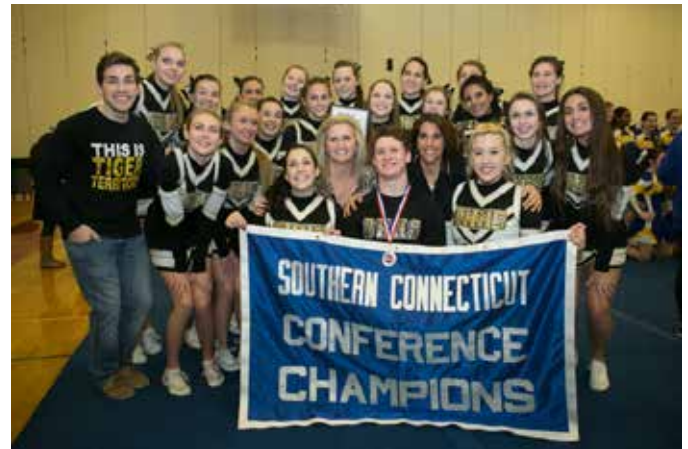
Daniel Hand won its second consecutive co-ed cheerleading title.