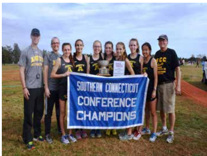
Amity Regional won its third SCC girls cross country title in 2015.

Mercy (4th in Class L) Daniel Hand (7th in Class L) Branford (7th in Class MM) Guilford (8th in Class MM) Amity Regional (8th in Class LL)