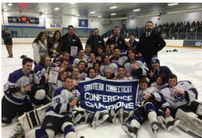
North Branford – Div. II boys ice hockey champions