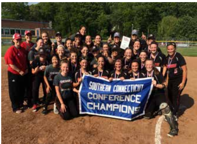
Cheshire won its first SCC softball title since 2002.