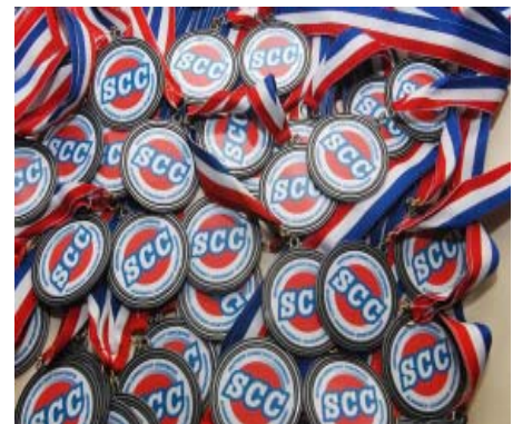
SCC Scholar Leader medals