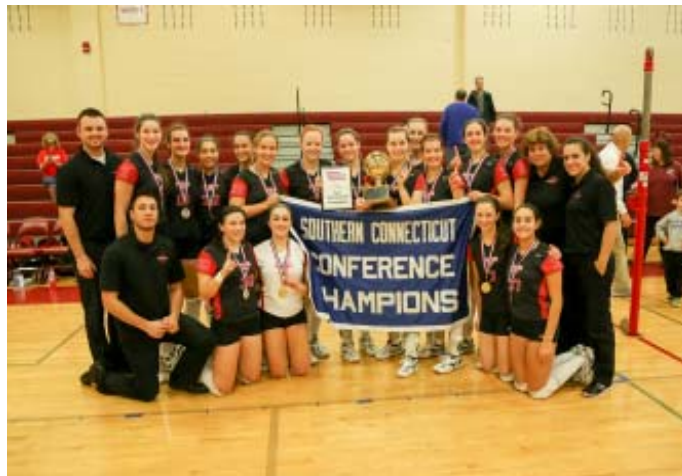
Cheshire became the third SCC girls volleyball team to finish the season undefeated.