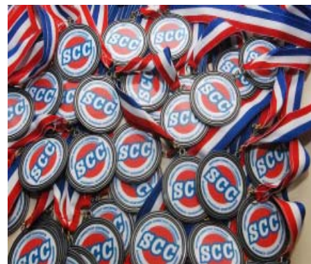
SCC Scholar Leader medals