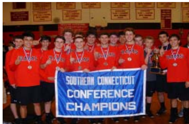
Cheshire captured its fourth straight SCC boys volleyball title.