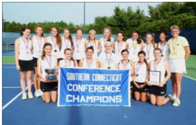
Daniel Hand captured its fifth SCC girls tennis title in the last six years.