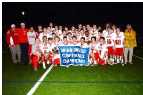
After winning the SCC title, Fairfield Prep won its sixth Class L state boys lacrosse title in the last eight years. The Jesuits defeated Staples, 14-8, in the championship.

Boys Cross Country – Guilford – Class MM Girls Swimming – Branford – Class M Football – Hillhouse – Class M – defeated Berlin, 34-12 Football – Daniel Hand – Class L – defeated Windsor, 23-6 Football – Xavier – Class LL – defeated Norwich Free Academy, 48-14