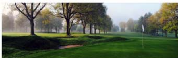
New Haven Country Club has been called "the best course in the state from the perspective of being fun to play and challenging."

Come help celebrate our "20th year" and support our league on June 16!