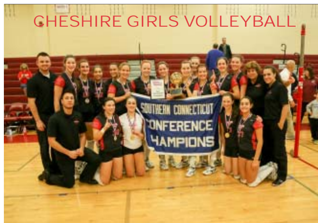
RAMS WERE PERFECT! Cheshire captured its third straight SCC girls volleyball title and then won the Class LL state title to finish a perfect 27-0.