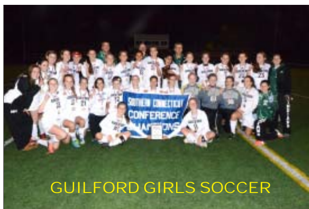
GUILFORD WINS CLASS L: After defeating Branford, 3-1, in the SCC title game, the Guilford girls soccer team again defeated the Hornets, 2-0, in the Class L state title game on Nov. 16 at West Haven HS. It was the 19th All-SCC matchup in a state championship game.