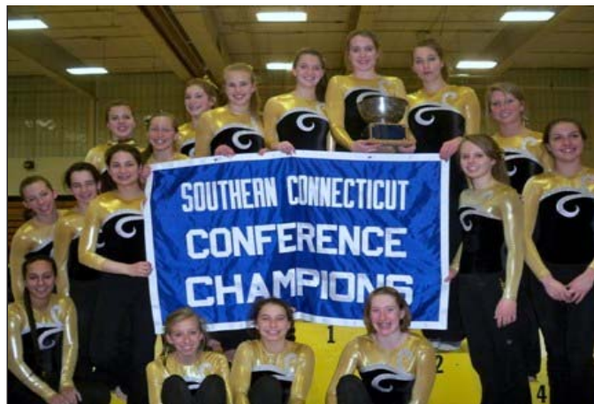
Daniel Hand captured its third straight SCC gymnastics title (and its 14th overall) in 2011.

1. Hillhouse, 106; 2. Career, 62; 3. Hand, 41; 4. Mercy, 38; 5. Hamden, 36; 6. Amity, 32; 7. Branford, 28; 8. Wilbur Cross, 27; 8. Cheshire, 27; 10. Guilford, 22; 11. Sheehan, 14; 12. North Haven, 13; 13. Shelton, 7; 14. Lyman Hall, 6; 14. East Haven, 6