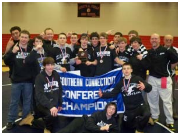
After winning its first-ever league title, the Xavier wrestling squad captured its first-ever state Class LL title in 2011.